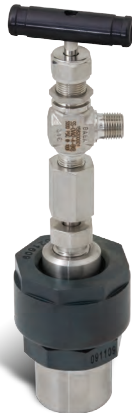
Model 4700-22mL-A Vessel shown with needle valve.

These vessels are normally heated in ovens, baths, or similar general purpose heating devices. Special heaters for these vessels are not available from Parr.