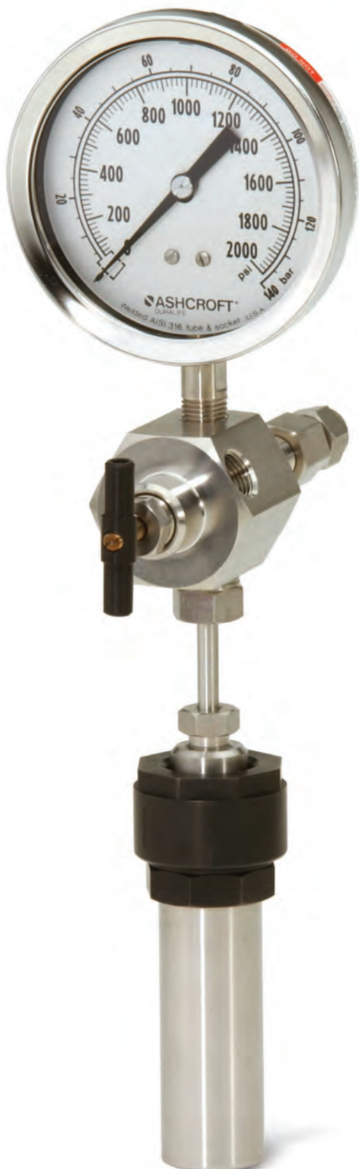
Model 4700-45mL-A Vessel, with 4310 Gage Block Assembly.

An example order number for a vessel this series is: