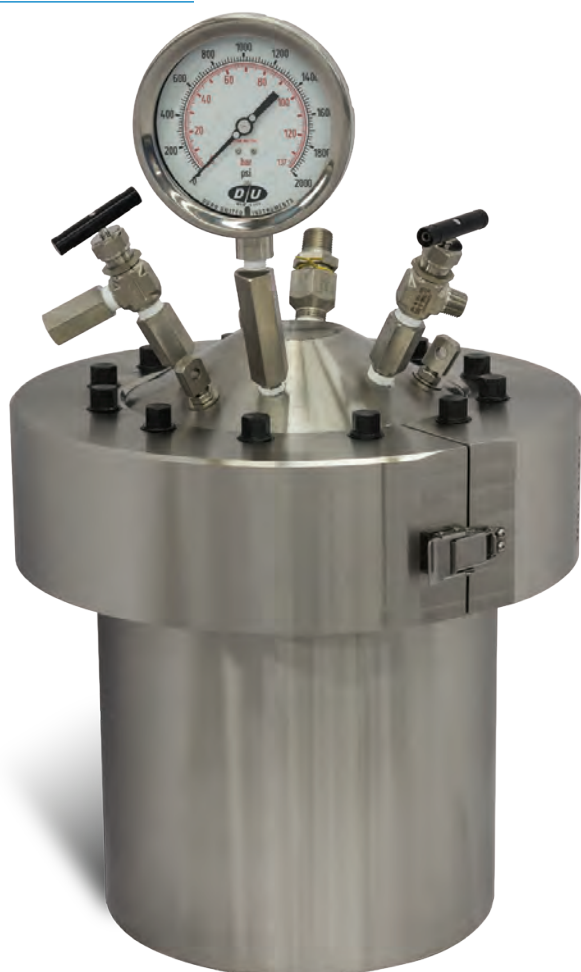
Model 4675-10L General Purpose Vessel