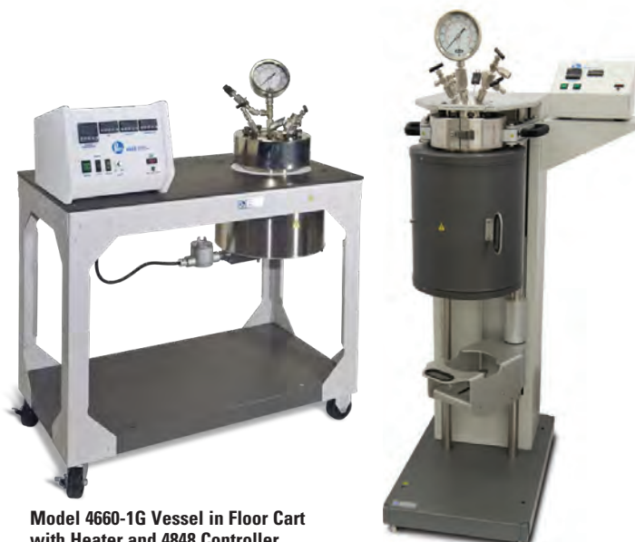
Model 4660-1G Vessel in Floor Cart with Heater and 4848 Controller